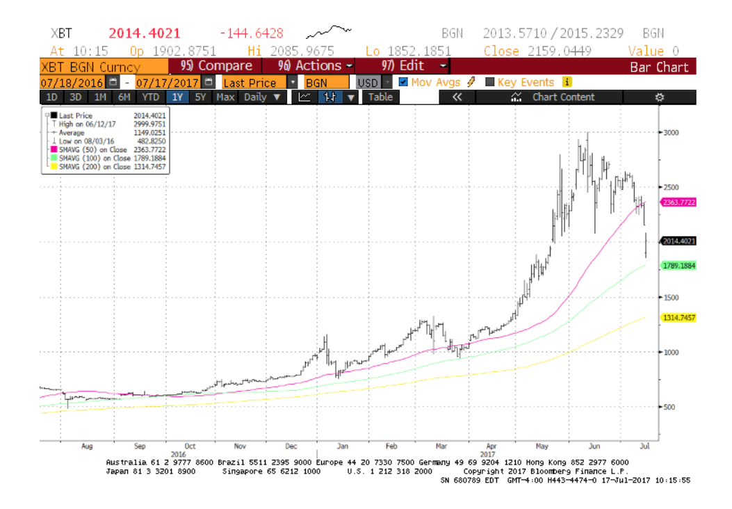
Figure 2: Performance of Bitcoin (7/15/16-7/17/17) [Bloomberg]

With respect specifically to bitcoin's volatility, roughly every year or so the currency experiences a rapid upward shock, followed by an equally rapid downward correction, reminding us far more of an enticing trading opportunity than a store of value. In one particularly vertiginous run in late 2013, bitcoin exploded 446% in less than a month from an 11/1/13 close of $208.18 [Bloomberg BGN "close" is 5 pm EDT] to an 11/29/13 close of $1,137, before falling 53% to a 12/17 close of $533.71. More recently, on 3/2/17, bitcoin ($1,257.94) surpassed the spot gold closing price ($1,234.31) for the first time, before catapulting to $2,999.98 on 6/12/17. From the shape of things in Figure 2, below , bitcoin appears to be rapidly unwinding early summer gains. We suspect many millennials are experiencing their first gut-wrenching encounter with market speculation.